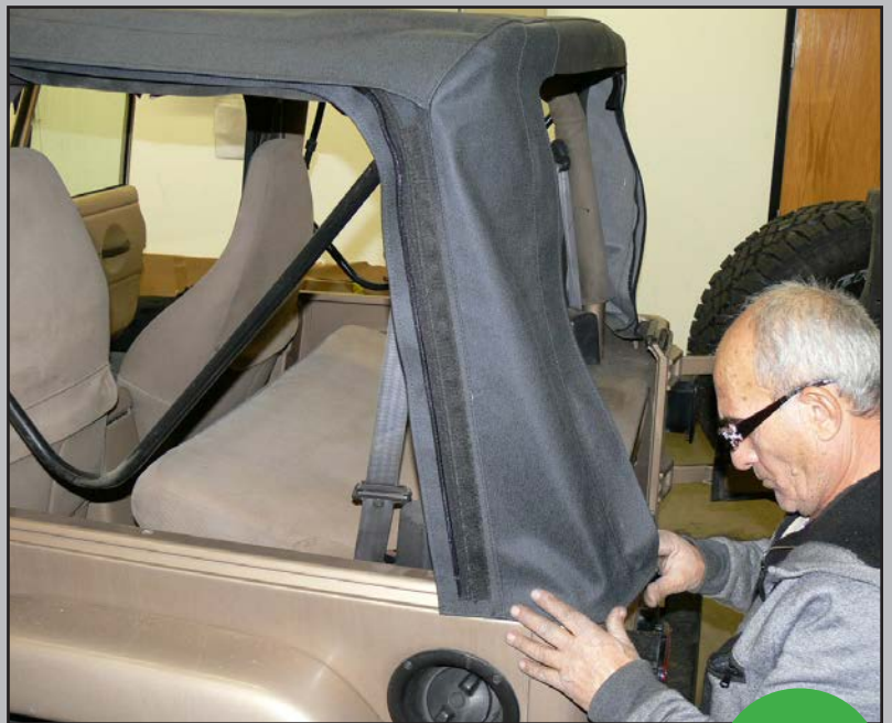
Secure lower rear corners

Secure replacement Top's L/R rear lower corners to the horizontal slots on vehicle