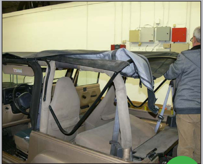
Secure Listing Straps to Crossbow

Retract (raise) the frame to closed position (do not latch), position Top over the crossbows and secure the L/R rear listing straps to crossbow.