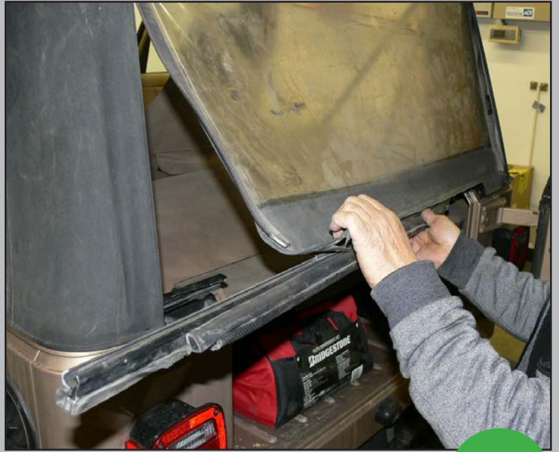
Partially Unzip Rear Window

Set aside the support rail to be used with the new top.