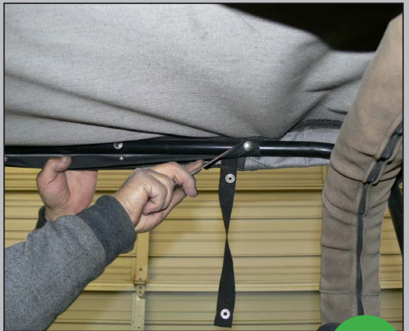
Remove existing rear windows

Completely unzip rear window and detach L/R Top bow listing snaps from rear crossbow.