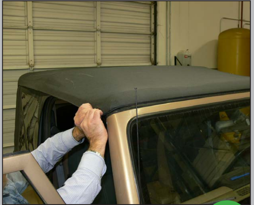
Force side extrusions into channel

Above each door, force the plastic extrusions into the retaining channels.