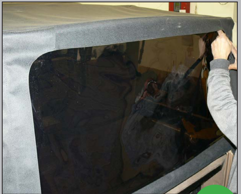
Connect window zipper slider

Connect the window zipper slider to the Top's zipper sleeve and run the slider from left to right to secure window into Top.