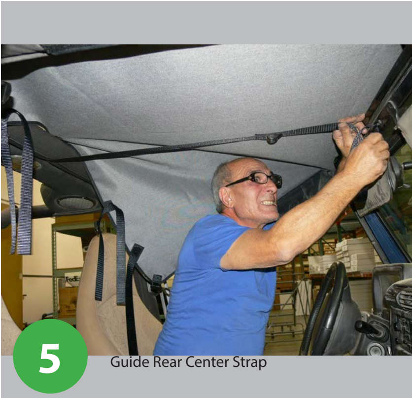
5 Guide Rear Center Strap

Stretch back the rear edge of the Sun Top over the roll bars, run the rear center strap behind the roll bar and forward to the windshield's support bracket.