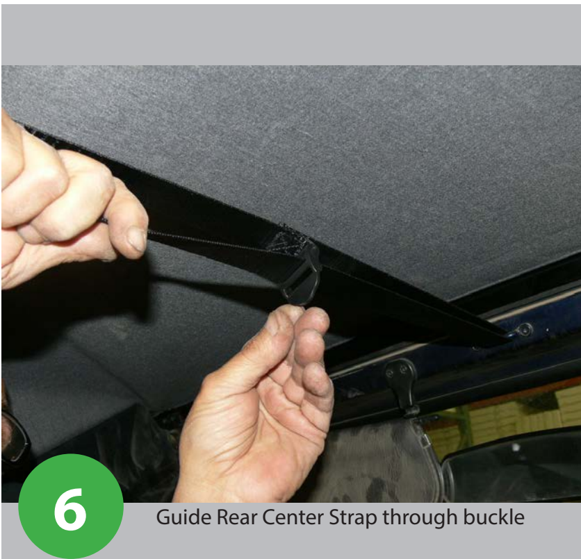
6 Guide Rear Center Strap through buckle

Stretch back the rear edge of the Sun Top over the roll bars, run the rear center strap behind the roll bar and forward to the windshield's support bracket.