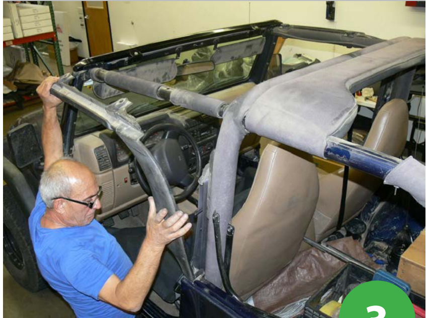
Remove Door Surrounds

Unscrew the two round support pins to remove the door surrounds from vehicle.