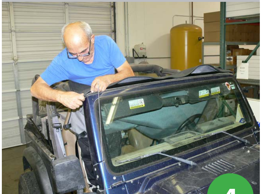
Insert Rear Center Strap

Position the Bikini Top over the roll bars and insert the front edge plastic retainer into the windshield channel.